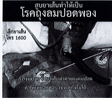
Tobacco smoking causes emphysema