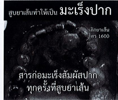
Tobacco smoking causes oral cancer