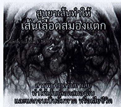
Tobacco smoking causes stroke.