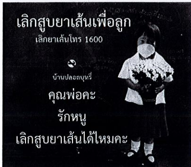
Quit tobacco smoking for your children