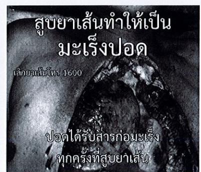
Tobacco smoking causes lung cancer