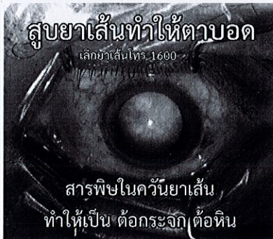
Tobacco smoking causes blindness