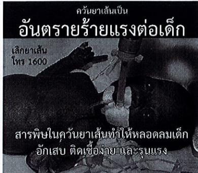
Tobacco smoke causes serious harm to children

Subject: Criteria, methods and conditions of packaging of tobacco or flavored tobacco products B.E. 2562 (2019)