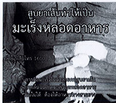
Tobacco smoking causes esophageal cancer