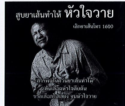
Tobacco smoking causes heart attack