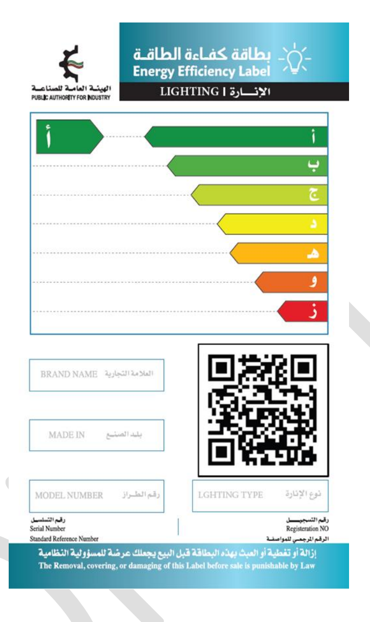
Figure 1 – Label for lighting products