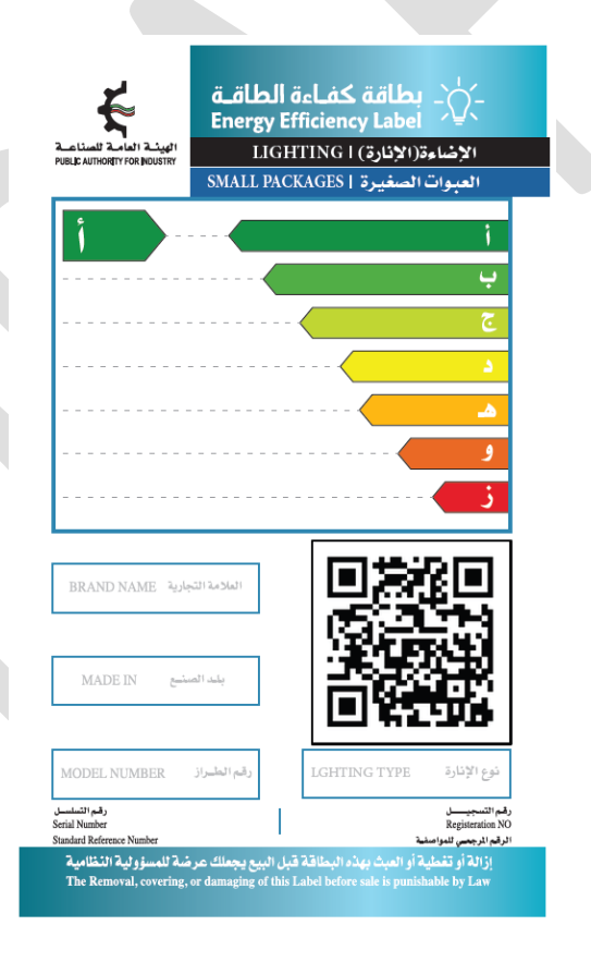
Figure 3 – Alternative label for small packaging